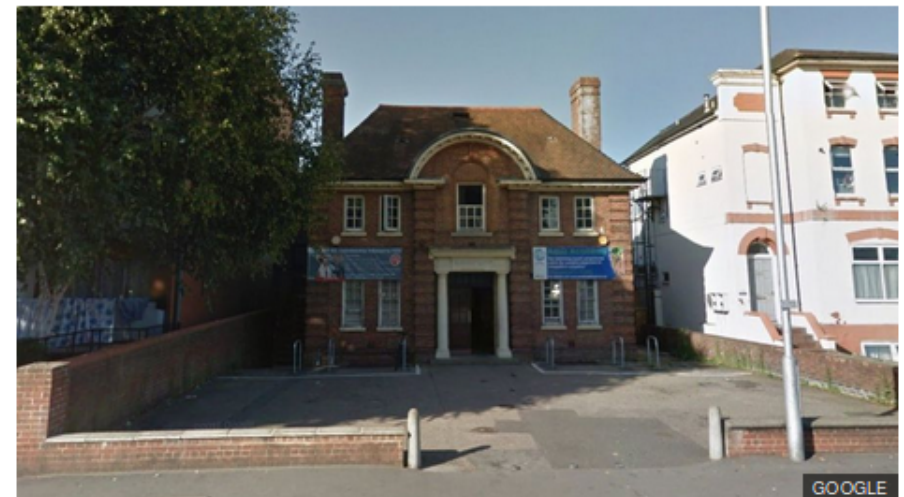
Arthur Hill Memorial Baths opened on 29 November 1911

A 104-year-old swimming pool has closed after a council said it could no longer afford to repair the building.